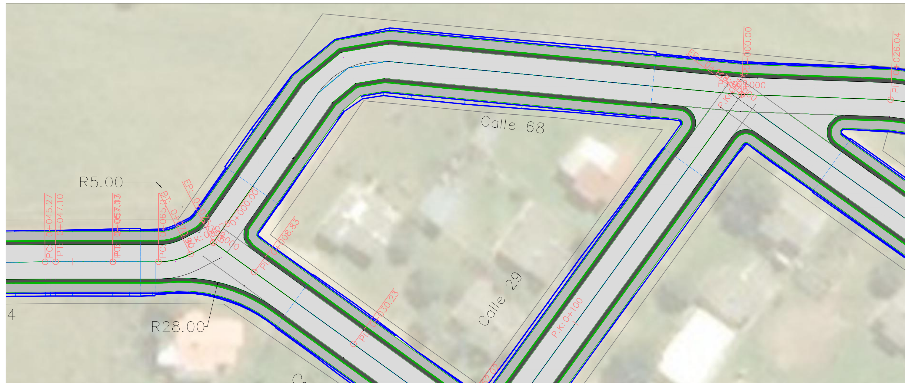
Perfil Longitudinal: Calle N°68; deformacion H:V = 5